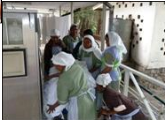
Our indispensable laundry ladies

Next time you have to face "Mount Wash-more" remember the former obstetric fistula patients who are now employed in the laundry at the Addis Ababa Fistula Hospital. There are mountains of sheets, blankets and theatre linen to wash and these ladies do it with a song and smile!