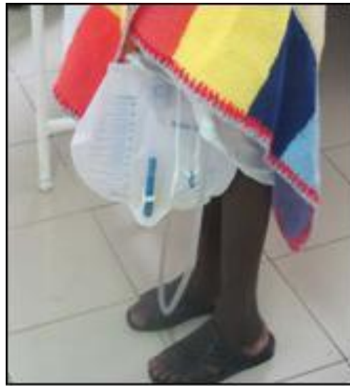
Patient with her 'special bag'

each time of using, so enabling those patients awaiting surgery to be dry. This also enables us to introduce an infection control policy throughout our hospitals